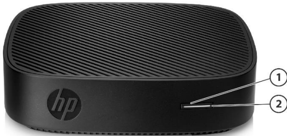
Front View Image